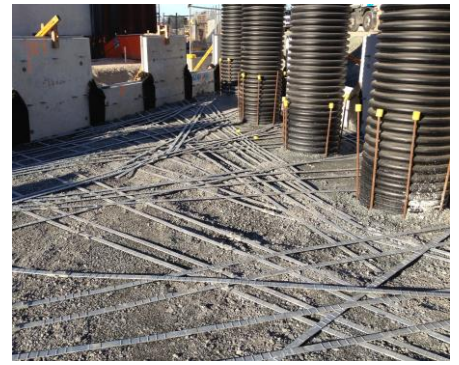
Left: Construction of the Controlled Modulus Column (CMC). Above: Reinforced Earth™ straps are being placed during the construction of the TerraPlus® Reinforced Earth™ walls.