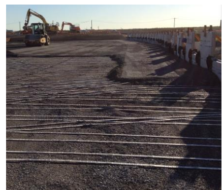
Main picture and above: Constructing the TerraPlus® Reinforced Earth™ walls for the Port of Brisbane Motorway Upgrade – Pritchard Street Overpass.